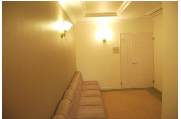
Lady's Room( Gynecological Examination Room)